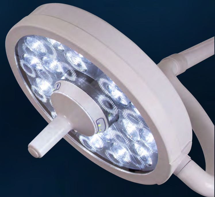
MI-750 Dual Ceiling Mount