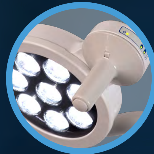
Sterilizable Handle and control grip