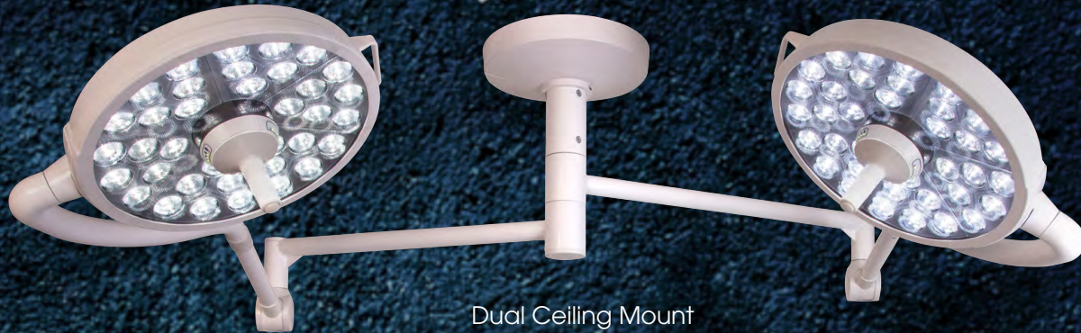
Dual Ceiling Mount