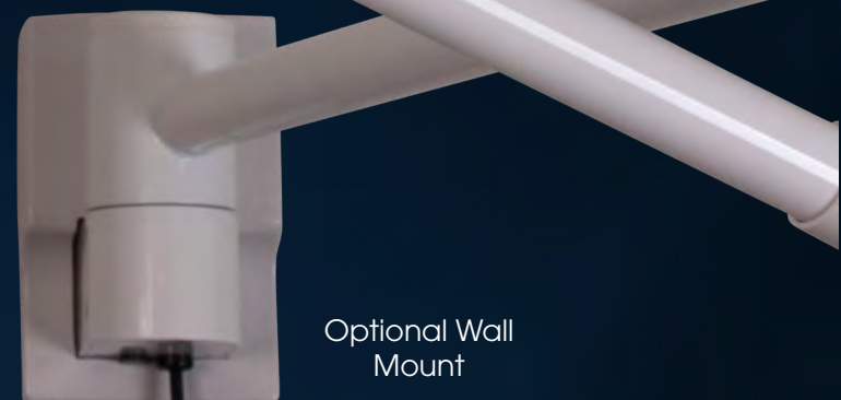
Optional Wall Mount