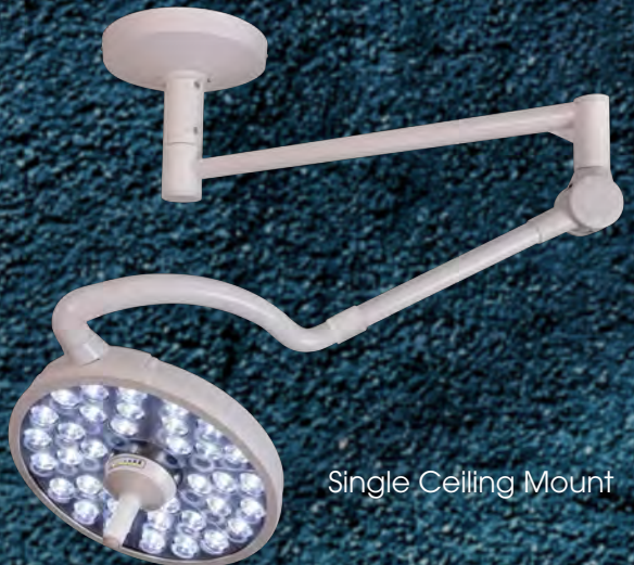
Single Ceiling Mount